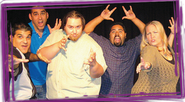
Just the Funny > Just The Funny, Miami's Home for Improv and Sketch Comedy, and 5-time winner of the New Times "Best of Miami" presents Fever Pitch. Sometimes dramatic, sometimes comedic and always intense, Fever Pitch will take you on a voyeuristic journey, where the lines get blurred from what is performance and what is real. Not for the faint of heart, Fever Pitch, tackles any and every subject, and is not appropriate for kids.