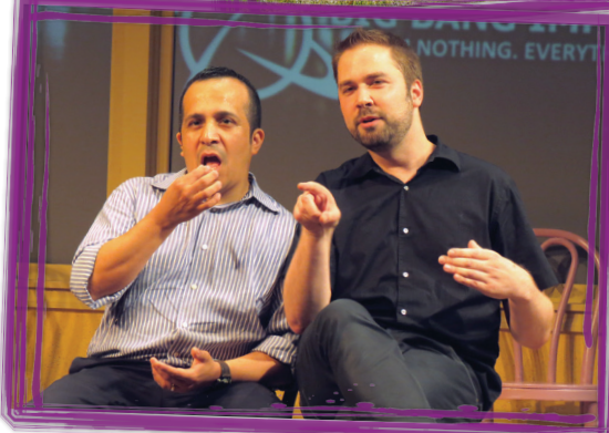
< Big Bang Improv Boston style freeform that has been wowing New England audiences and at festivals around the world for years. The entire set moves seamlessly from one scene to the next at the rate of over a scene a minute all following the group play philosophy of "follow the funny." The show builds rapidly and culminates in a series of surprising and organic callbacks done through unique editing styling and storytelling.