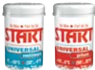
Universal kick waxes