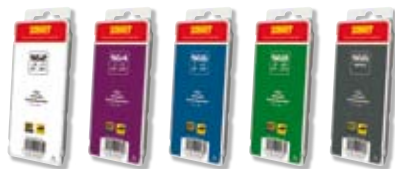
Start SG gliders