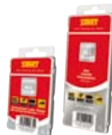
Start Universal gliders