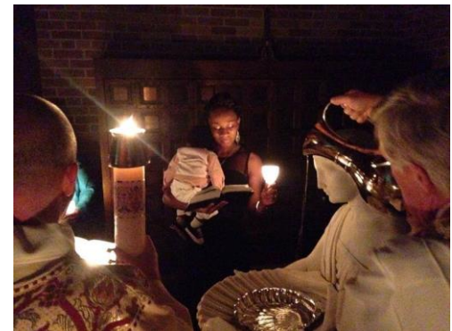
Above: Easter Vigil

Remember to like us on Facebook, follow us on Twitter, and visit us at www.StPaulsNOLA.org to get up-to-the-minute updates on church events!