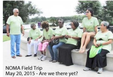
NOMA Field Trip May 20, 2015 - Are we there yet?