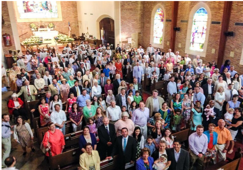
Left: St. Paul's congregation poses for our annual photograph.