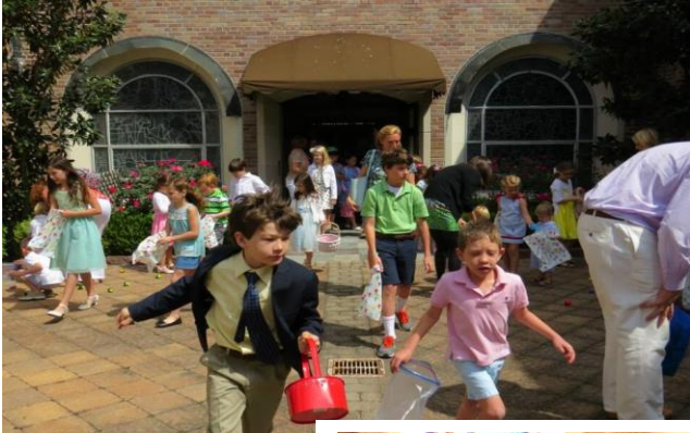
Above: St. Paul's Easter Egg Hunt