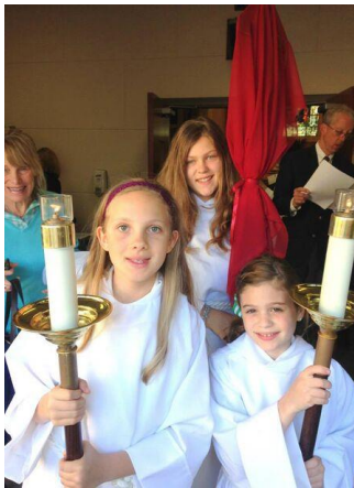
Above and Right: Palm Sunday