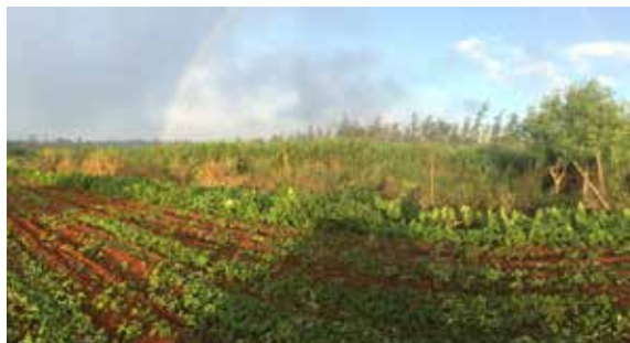
Weeds out of control a few weeks after planting, and after a lot of rain.

prior to flaming or you will end up melting drip lines. After weeds show signs of dying, plant huli in rows trying to not to disturb the ground. Disturbing soil will bring new weed seeds to the surface and will require additional weeding. Weed control cannot be overstressed, because many upland taro fields have been lost to weeds.