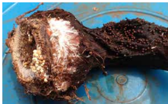
Southern Blight Sclerotium rolfsii is an important disease of lowland areas throughout the Pacific and favors moist, warm conditions.

When utilizing drip irrigation, a single or double row can be planted on each planting line. However, experience has shown that double row systems can be problematic since vigorous growing varieties with large root systems, and cultivars with many huli can choke drip irrigation lines, decreasing water flow to the remainder of the row. Single drip lines can easily be moved away from aggressive, rapidly spreading plants.