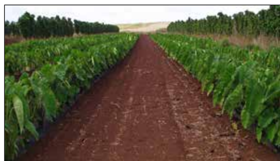
Upland taro in Ho'olehua, Molokai grown in plastic mulch under a wide row system to facilitate cultivation by tractors. Weed control is a major challenge in upland taro production.

Stress is the destroyer of taro and predisposes it to maladies, including susceptibility to attacks by insects and arthropods, and diseases, including poor or imbalanced nutrition. In less than ideal conditions, the taro plant will adjust to the environment in a sustainable or subsistence system, but the end result will be a lower relative yield, and usually quality.