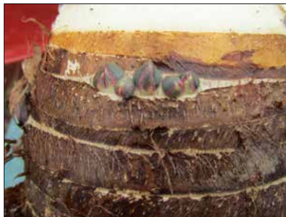
The Hawaiian cultivar Mana ke’oke’o with its characteristic multiple, ‘branching’ buds or makamaka with hot pink stripes.

With a decrease and unreliability of sufficient water flow to cultivate wetland taro due to diversions and the taking of wetland for other uses, expansion of wetland taro is limited. As a consequence, upland taro production is viewed as an alternative. However, in many respects, wetland and upland taro are distinct products in terms of corm quality and poi characteristics, and examples include relative corm density or dry matter content, and poi souring characteristics.