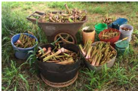
Without huli, you cannot plant or harvest taro. Maui Lehua

possibility of creating an entry way for disease.