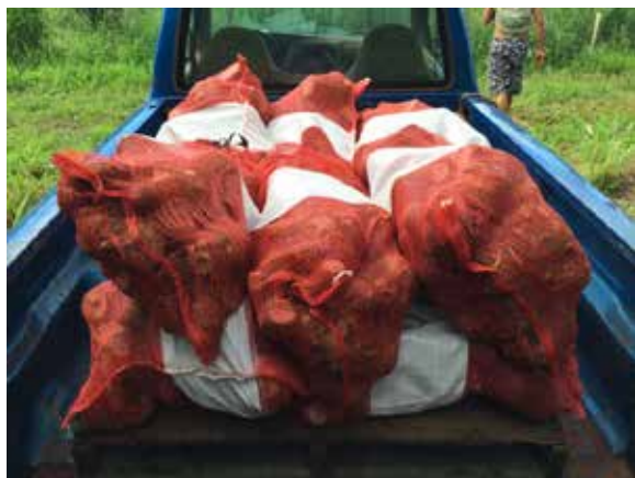
Bagged taro, ready for delivery or shipment to off-island markets

This includes digging, transporting, cleaning, washing, sorting, grading and packing. A harvesting continuum or flow needs to be developed to minimize the cost and the amount of 'touches' to the corm. It's a matter of convenience and preference, as well as having a comfortable place to work, especially during hot summer months.