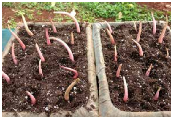
Sometimes the only way to preserve a special variety is by propagating and growing them in flats. A Pi'i ali'i mutation with pink-fleshed corms.

The spacing between plants, both in rows and between rows, is an important planning consideration. Close spacing limits air circulation and creates environmental conditions favorable for pests, including arthropods and insects, and will influence mature corm size and yields.