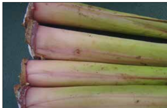
Growing taro starts with healthy, disease-free huli – Maui Lehua is believed to be a cross between Lehua maoli and Moi.

Another method is to plant medium to large huli at 6 inch spacing and fertilize well. After a couple months, chop leaves off of the makua to activate buds or makamaka to create oha. Dig out plants when they reach acceptable size for replanting.