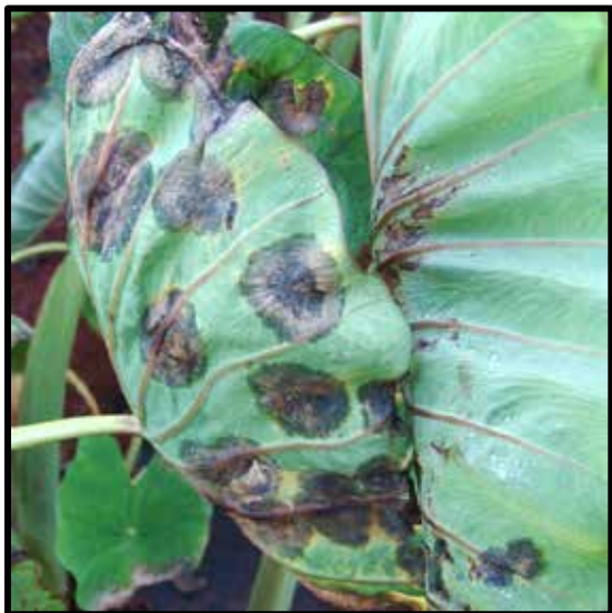
Taro Leaf Blight Phytophthora colocasiae , is the most destructive disease of taro, and favors calm, cold, wet overcast conditions.

of organic mulch and compost, plastic mulch, and also weed mat between rows. Each system has its pros and cons, affecting not only water distribution and growth, but also quality, yield, and cost of production.