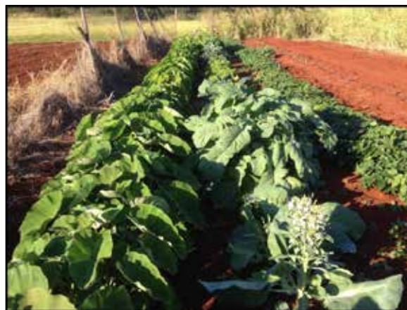
A ‘huli’ bank grown in a garden by covering small corms after a harvest. This allows for ready access to huli and can also be used for leaf production.

After weeds emerge, either burn weeds with a flamer or spray with a contact or systemic herbicide to kill the weeds. If using a flamer, it’s important to treat weeds when very small such as less than ½ inch tall or in the three-leaf stage otherwise larger, more fibrous weeds will not be killed.