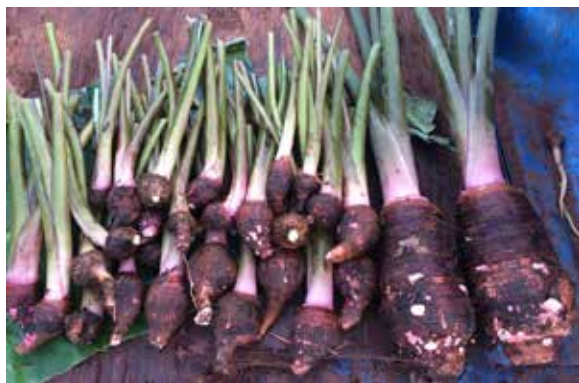
Two ohana of Piko ulaula with 14 oha each

Huli is the upright stem between the leaf and corm and includes a piece of the corm attached where roots emerge. Huli starts as buds or makamaka, and sprouts into oha or babies growing off the makua or mother plant. Each stem scar creates a line on a corm having at least on growing bud, or in some cultivars, a cluster of growing buds, although many may be blind or dormant and will not form into oha.