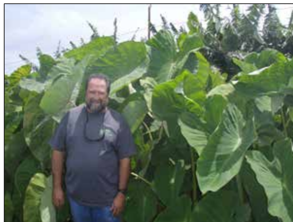
Taro requires consistent water to grow healthy, tall, and strong. The author in his element.

Taro is not well adapted to high-temperature, lowland conditions since its native to more upland weather with cooler climates and a larger day-night temperature differential. Under extreme conditions, frequent irrigation of more than twice daily may be utilized as a strategy to cool plants off in order to slow the metabolic rate and minimize stress that could lead to internal corn breakdown or worse.