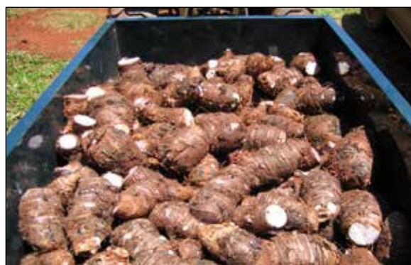
Harvesting a mixture of taro varieties, including hybrids and Hawaiian varieties.

Another consideration is the size and maturity of oha since it can add substantial weight to the overall yield of a crop. Field and increment size, as well as market demands are also considerations on when to harvest since some fields may take a while to harvest, while in high demand periods, large fields will be harvested.