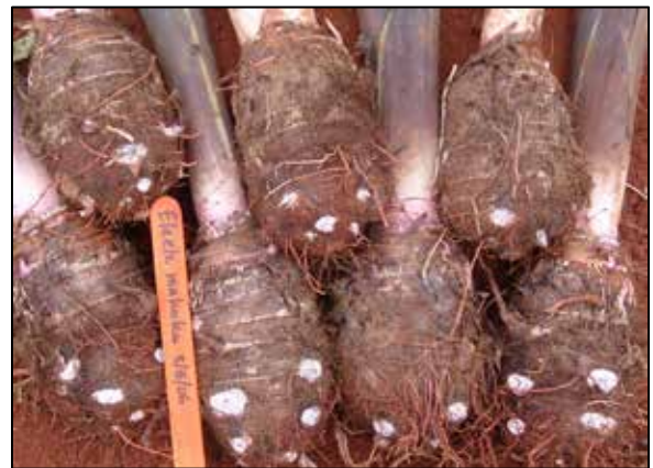
Eleele makoko , an excellent upland taro variety from Kona with purple corms.

Well-planned crop rotations utilizing nematode-resistant species, fallow, and the use of cover and green manure crops are all part of the farmer's tool box to mitigate disease and nematodes, but there are costs that must be considered. The addition of organic matter, either through importing material or through the growing of high organic matter species in a rotation system should be an ongoing strategy.