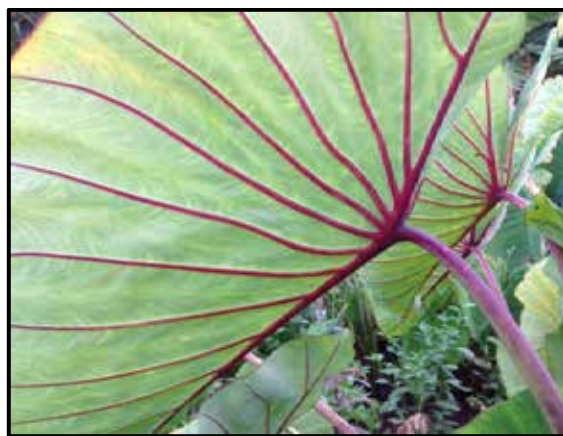
Bun Long Woo is the most common variety used for leaf production in Hawaii.

It’s also important to consider nutrient replacement when intensively harvesting leaves versus harvesting under a more sustainable production system. Each time you harvest leaves, you’re removing nutrients from the system that will need to be replaced in order minimize plant stress and optimize plant and leaf recovery and growth.