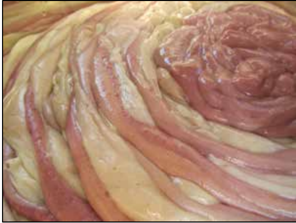
Mixing different taro cultivars together can increase the complexities and innuendos of taste.

In closing, this is far from an exhaustive treatise on the growing of upland taro, since much more detail is involved in growing this culturally and vitally important staple for better health.