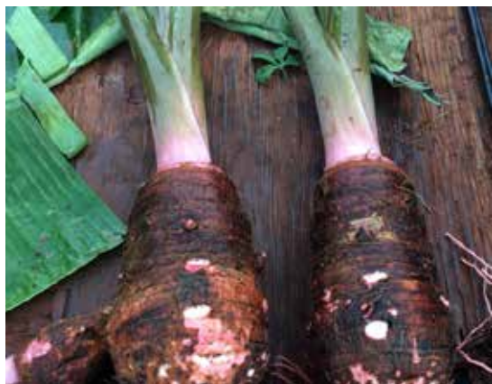
Hawaiian cultivar Piko ulaula is well adapted to upland growing conditions and can grow quite large.

There are diverse methods of growing upland taro, including traditional systems utilizing heavy compost in a living, slow-release organic system, modern high-input production systems, and hybrid systems utilizing the best of both growing systems. These options should be thoroughly investigated prior to planting, considering soil and plant health over the long term, labor requirements, and above all, cost and returns in a quadruple bottom line.