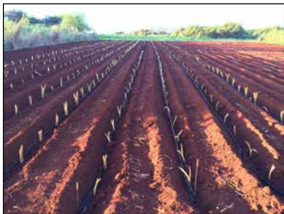
Maui Lehua grown in a furrow system. Water stays in the center of furrows close to the huli, and roots grow deeper in the ground, protected from the surface heat.

allow plant canopies to shade the ground faster, allowing for quicker weed suppression. Planting large, fresh, healthy huli is very important so individual plants can control their ground earlier, and provide a strong, broad canopy to shade out weeds.