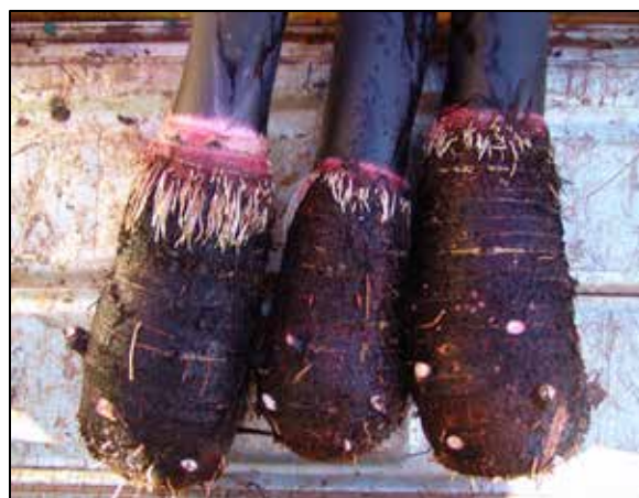
Lauloa eleele ula when grown through the winter will regrow in spring due to high moisture conditions and also from environmental triggers signaling the start of a new season

There appears to be ideal seasons for the growing of taro, from early Spring into Winter when plants are less affected by slowed growth of short days and wet, cold weather, but this information does little to facilitate the production of year-round taro.