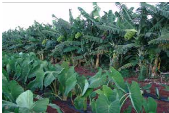
Banana complements taro as a windbreak and also in creating a positive growing environment

360 pounds can be delivered to plants in a crop season through a constant-feed fertigation system. Again, the targeted size of corms at harvest should be determined by market demands.