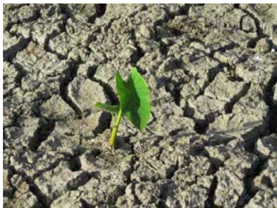
Taro needs water to grow, whether in wetland or dryland systems. A dried lo'i in Hanalei, Kauai