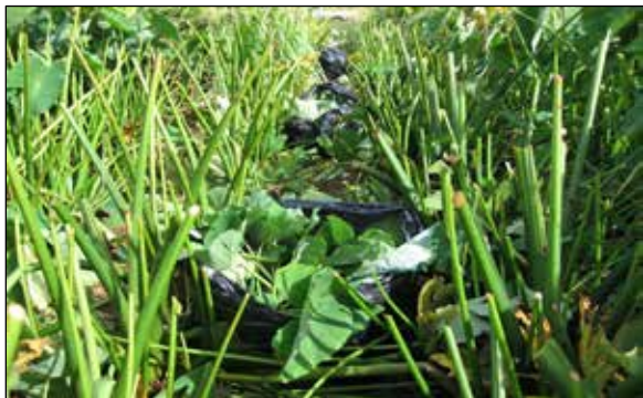
Harvesting leaves, then corms for shipment to Maui for processing into taro burgers. 2011

plants grow slower and have difficulty taking up fertilizer, especially Phosphorus. Less than ideal weather conditions for growth and ideal conditions for disease during rainy months can predispose plants to stress, creating ideal conditions for disease that can affect corm quality.