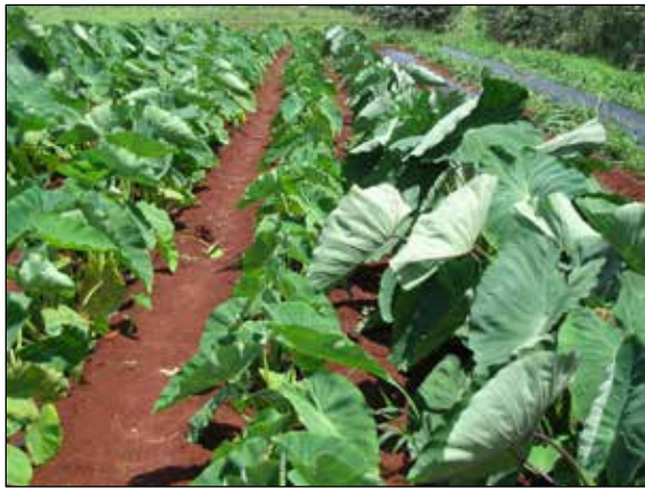
Varieties grown for leaves: Palauan (2 middle rows), and Bun Long Woo. (far right) The Palauan started off slowly, but soon surpassed Bun Long Woo.

temperature conditions creating a stringy, hard leaf that can double the cooking time as well as the quality of the cooked product, including laulau and luau, and is more prominent during summer months. Windy conditions can increase the production of fiber as plants adjust to this condition, and can be aggravated by a nutrient imbalances created by the plant's higher demand for nutrients during long summer days.