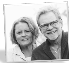
Mary Beth Chapman & Steven Curtis