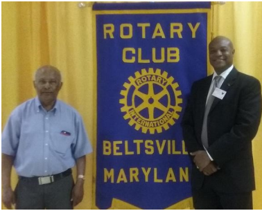
Meetings with the Prince George's County Rotary Club and the Office of the Mayor of Baltimore