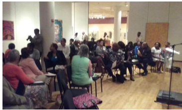
Radio personalities and representative from nonprofit Organizations based in Baltimore.