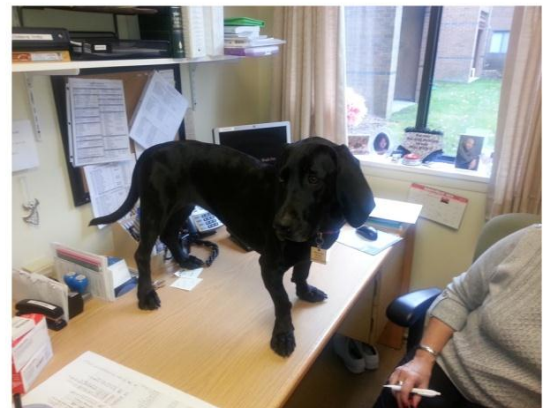
Helping out the Boss