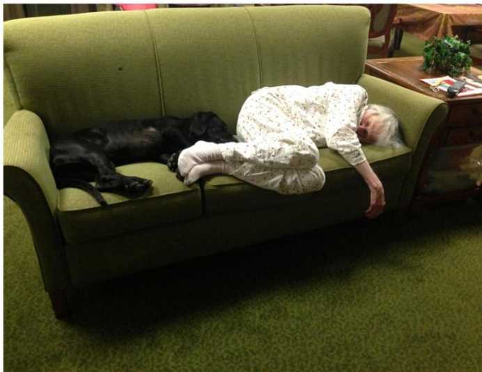
Glad Rosemary was up tonight so we could spend some time together