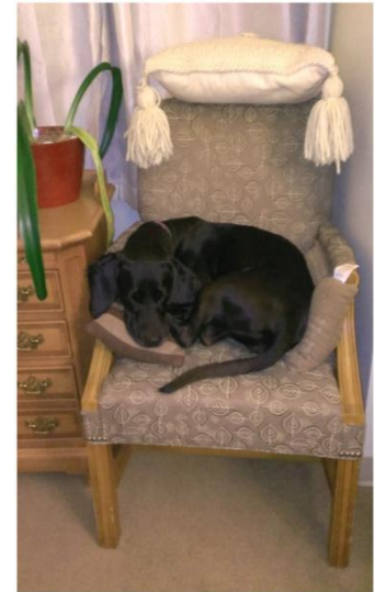
Keeping watch over Janet before she left