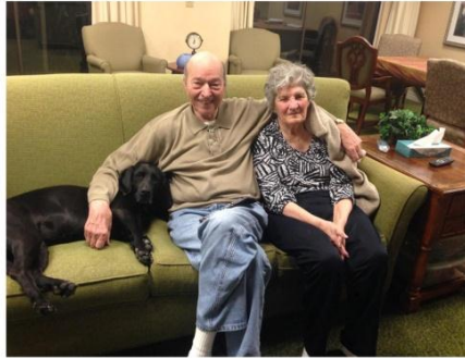
My favorite couple - he brings me a treat every night