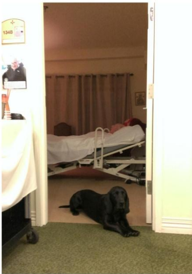
Keeping watch over Carl before he left