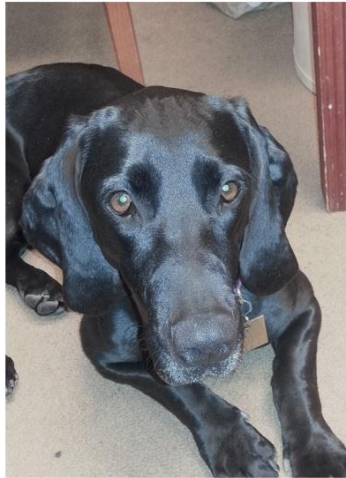
My official ID photo