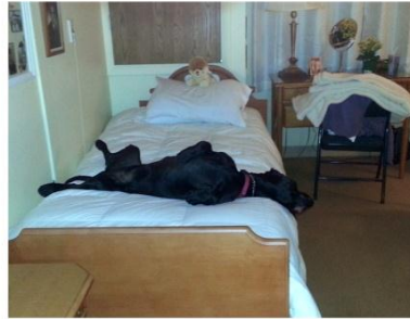
Nothing like a good nights sleep after a day of hard work