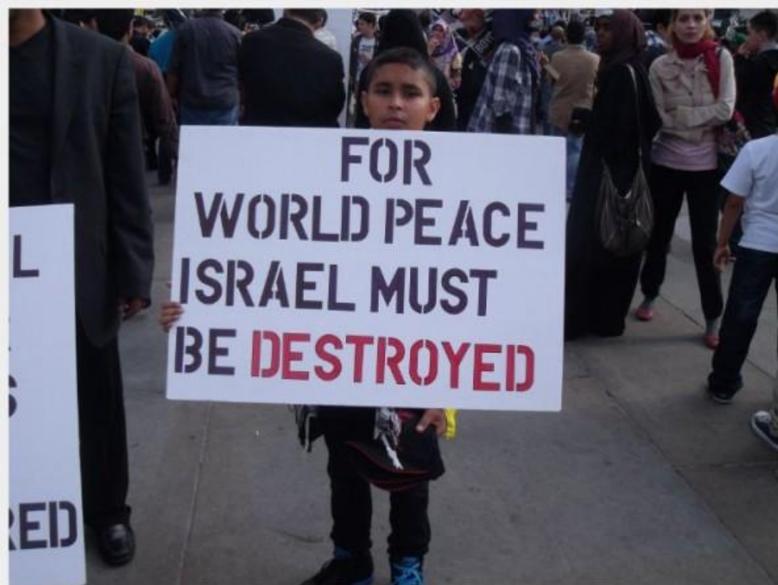
Trafalgar Square, London, 21st August 2011

Reader-created contact list and call to action.