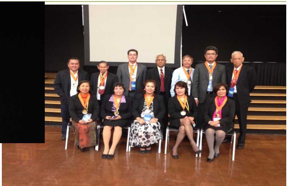
Members of the Filipino Delegation at the TREEDC Conference