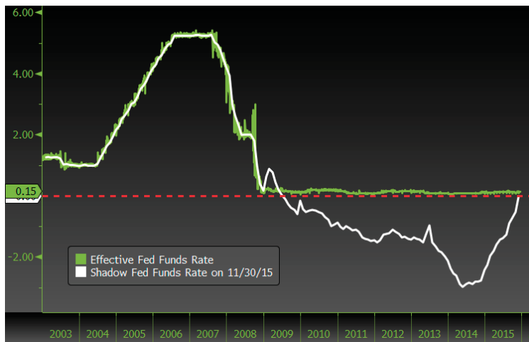
FIGURE 2: ATLANTA FED'S ALTERNATIVE FED FUNDS RATE

White line indicating 250 basis points (2.5%) of tightening already.