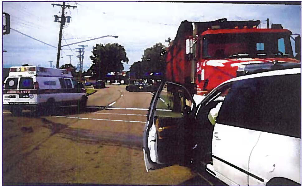
Scene above: STAT EMS at a motor vehicle accident—dangerous situations are an everyday occurrence whether a crash or general medical situation.

STAT officials indicate there is an increase of attacks on medical personnel across the Nation and many agencies are turning to provide body armor and additional training to mitigate these conflicts. "While every situation is different we rely on our EMS staff to use their training, best judgment and keen sense of TEAM awareness to protect themselves. It's terrible that we even have to talk about such a thing," says STAT EMS Sgt. Chris Samon.