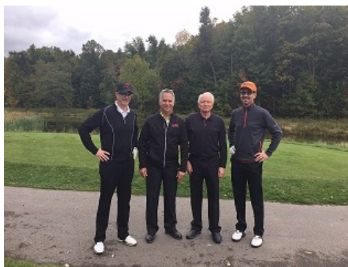
Winning Team: left to right