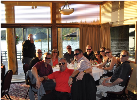
Enjoying a networking dinner on the island