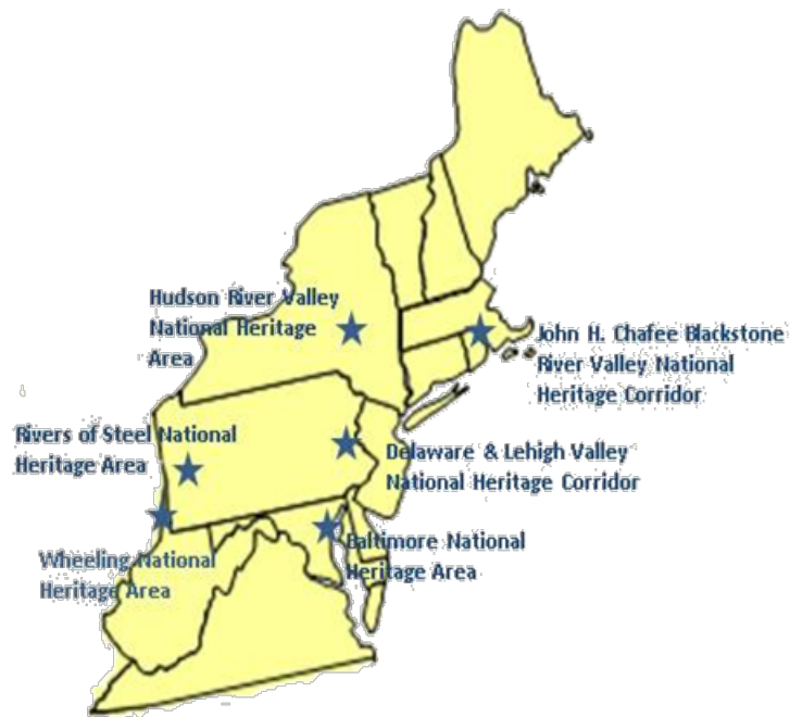
Six National Heritage Area Case Study Sites in the Northeast Region

The report herein is the Economic Impact of National Heritage Areas. The study assesses the economic benefit of specific NHAs to their regions, states, and local communities by measuring employment and revenue generation and economic impacts through a protocol comprising of interviews, focus groups, economic impact analysis, and secondary data analysis. Additional extrapolations estimate the national economic benefit of all NHAs. The research protocol included site visits to each of the six NHA regions listed in Table 1, focus groups, and interviews with key stakeholders within the six NHA regions, facilitation and data collection of existing NHA visitor estimates, operating budgets, and grant/awards information. The data collection process guided the economic impact analysis, and subsequent estimations, using IMPLAN economic impact software.