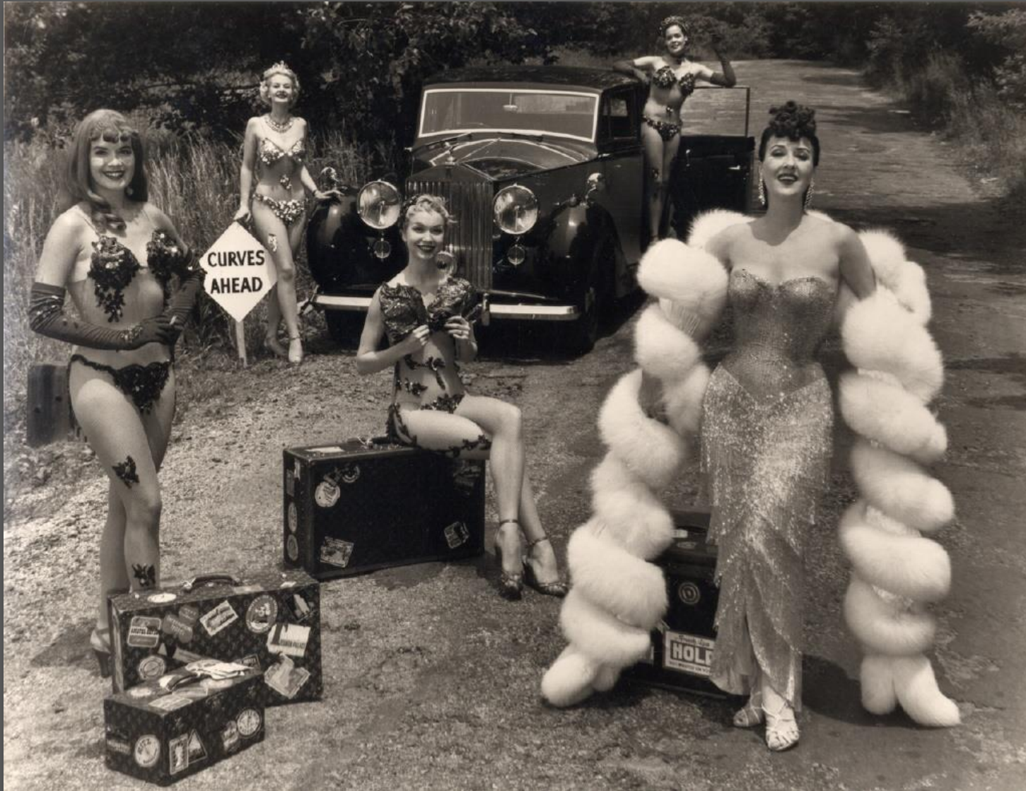
Gypsy Rose Lee in Curves Ahead, 1950