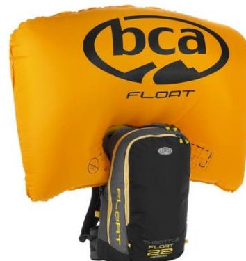
Float Throttle - blk