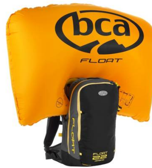
Float 22 - blk