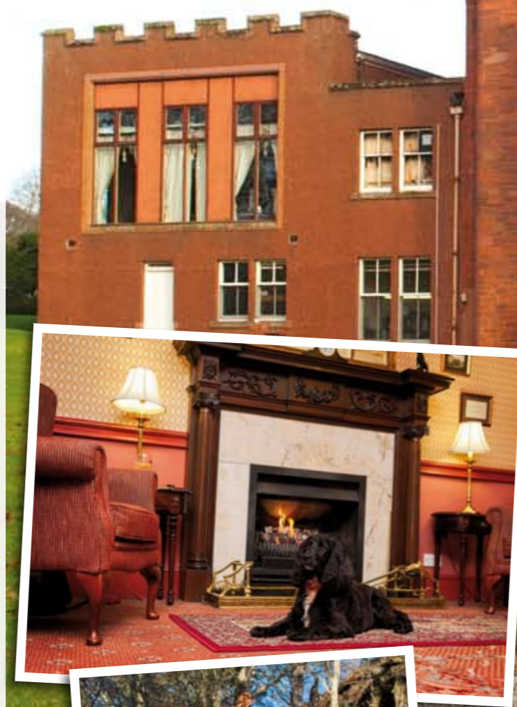
The grounds of Dryburgh Abbey Hotel

Guests can eat in the à la carte Tweed Restaurant or in one of the private dining rooms (these are upstairs so enjoy amazing river views) but Shula wasn't allowed in these so