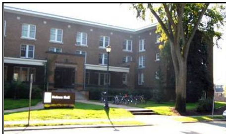
Nelson Hall Lounge, UWSP 1209 Fremont Street Stevens Point, Wisconsin