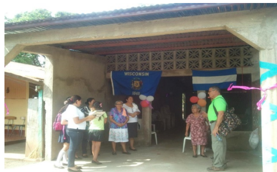
Visitors at Los Cedros