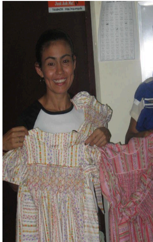
Arly Bakery teacher