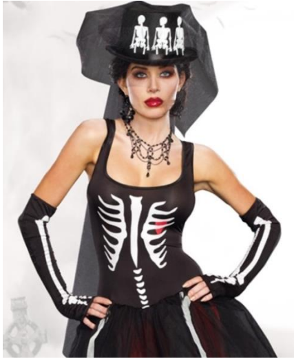
Style 10005 Ms. Bones Hat Size: O/S $7.25