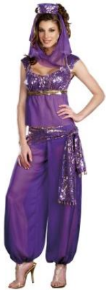
Style 7572 Ally Kazaam Size: S, M, L, XL $25.95