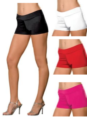
Style 4575 Roxie Hot Short Black, White, Red, Hot Pink Size: S/M, M/L $5.75 Also Available in Plus