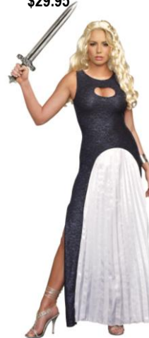
Style 9886 Queendom Come Size: S, M, L, XL $28.95