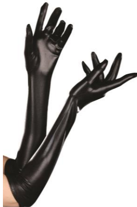
Style 7819 Dominique Glove Size: O/S $4.50