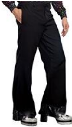
Style 9605 Men's Disco Pant Size: M, L, XL, XXL $9.25