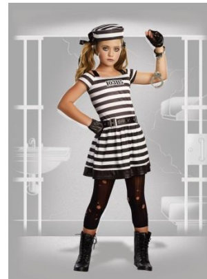
Style 9955 Hannah Cuffs Size: S, M, L $14.95