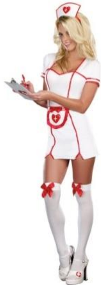
Style A8922 R.Eally N.aughty Nurse Size: S, M, L, XL $11.95 Also Available in Plus