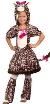
Style 9020 Gigi Giraffe Size: S, M, L $13.95