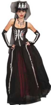
Style 9903 Ms. Bones Size: S, M, L, XL $28.95