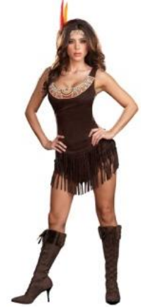
Style 5877 Pocahottie Size: S, M, L, XL $25.95 Also Available in Plus