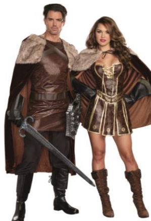
Style 9827 Victorious Beauty $29.95 Style 9409 Dragon Warrior King $25.95