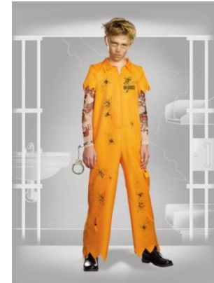
Style 9956 Escaped Convict Size: S, M, L $11.95