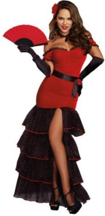
Style 9967 Flamenco Size: S, M, L, XL $27.95