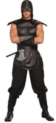
Style 9874 The Assassin Size: M, L, XL, XXL $19.95