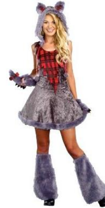
Style 8986 Full Moon Sass Size: XS, S, M, L $15.95