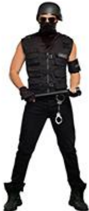
Style 9444 Special Ops – Male M, L, XL, XXL $24.95