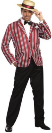
Style 9838 Good Time Charlie Size: M, L, XL, XXL $24.95