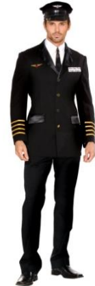
Style 5236 Mile High Pilot Hugh Jorgan M, L, XL, XXL $24.95