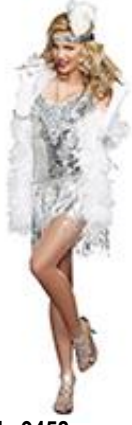
Style 9458 Life's a Party Size: S, M, L, XL $24.95 Also Available in Plus