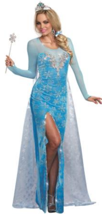
Style 9897 Ice Queen Size: S, M, L, XL $28.95