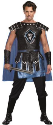
Style 9825 King Slayer Size: M, L, XL, XXL $24.95