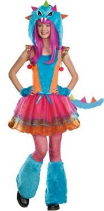
Style 9001 Fur-ocious Creature Size: XS, S, M, L $15.95