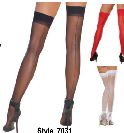
Style 7031 Sheer Thigh High w/Seam Black, Red, White Size: O/S $1.50