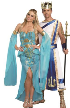
Style 9853 Sea Goddess $29.95 Style 9854 Poseidon $21.95