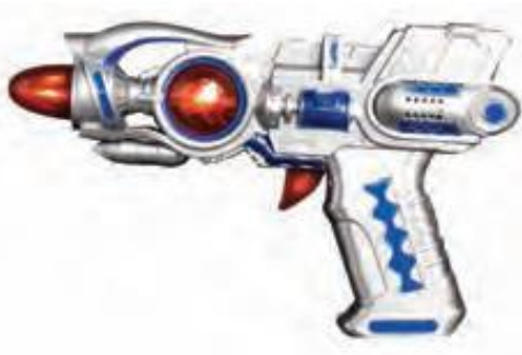
Style 9971 Galaxy Gun Size: O/S $2.50