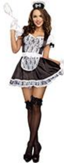
Style A9507 Maid For You Size: S, M, L, XL $10.95 Also Available in Plus