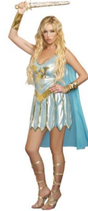
Style 9487 Dragon Warrior Queen Size: S, M, L, XL $25.95