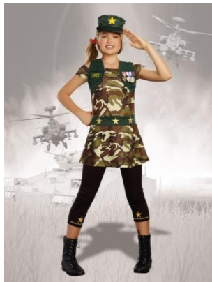
Style 9932 Cadet Cutie Size: L, XL $15.95