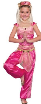
Style 9576 Dream Genie Size: XS, S, M $11.95