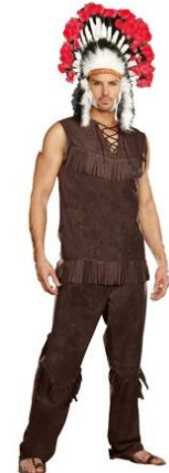
Style 9189 Chief Long Arrow M, L, XL, XXL $23.95