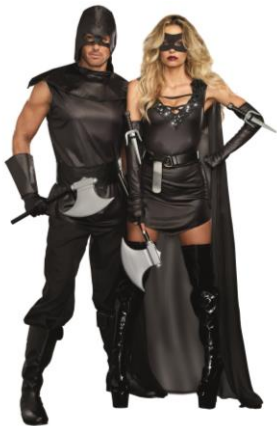
9873 The Assassin (F) $25.95 9874 The Assassin (M) $19.95