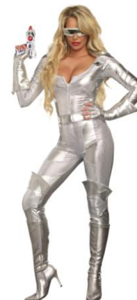
Style 9852 Space Wars Size: S, M, L, XL $26.95