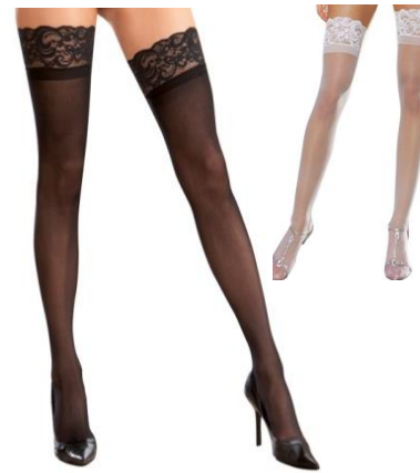
Style 7030 Sheer Thigh High w/Lace Top Black, White Size: O/S $3.75 Also Available in Plus