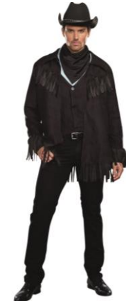
Style 9832 Buck Wild Size: M, L, XL, XXL $24.95