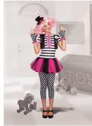
Style 9949 Clownin' Around Size: S, M, L, XL $14.95