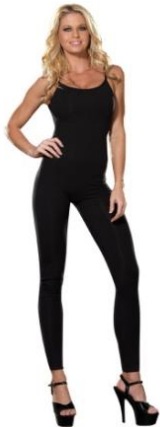
Style 0072 Basic Unitard Size: S/M, M/L $11.95 Also Available in Plus