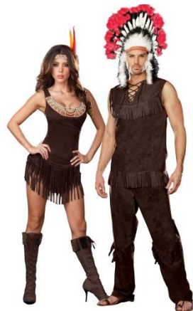
Style 5877 Pocahontie $25.95 Style 9189 Chief Long Arrow $23.95