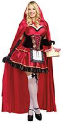
Style 9477X Little Red Size: 1X/2X, 3X/4X $30.95