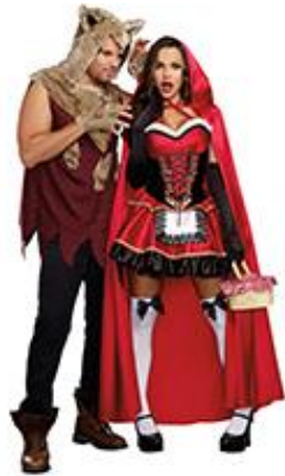
Style 9477 Little Red $28.95 Style 9493 Big Bad Wolf $24.95