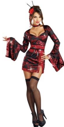
Style 8852 Geisha with the Dragon Tattoo Size: S, M, L, XL $25.95