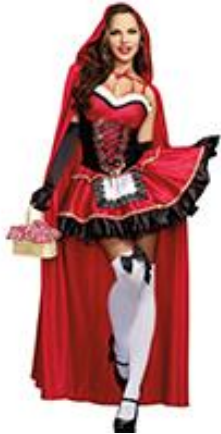
Style 9477 Little Red Size: S, M, L, XL $28.95 Also Available in Plus