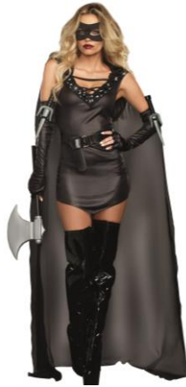
Style 9873 The Assassin (F) Size: S, M, L, XL $25.95