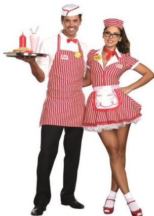
Style 9975 Diner Doll $29.95 Style 9976 Diner Dude $13.95