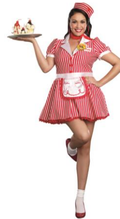
Style 9975X Diner Doll Size: 1X/2X, 3X/4X $26.95