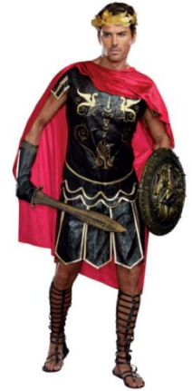
Style 9841 Julius Caesar Size: M, L, XL, XXL $25.95