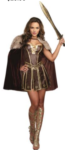
Style 9827 Victorious Beauty Size: S, M, L, XL $27.95