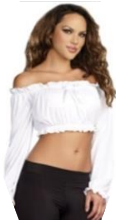
Style 8358 Pretty N' Peasant – Black, Red, White Size: S/M, M/L $5.50