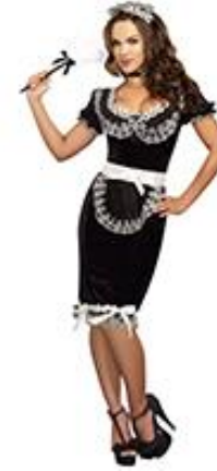
Style 9417 Keep It Clean Size: S, M, L, XL $25.95