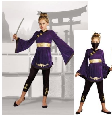
Style 9928 Lotus Warrior Size: L, XL $14.95