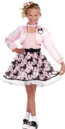
Style 8282 Pretty in Poodle Size: S, M, L $15.95