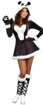
Style 8793 Panda Bear Baby Size: S, M, L, XL $23.95 Also Available in Plus