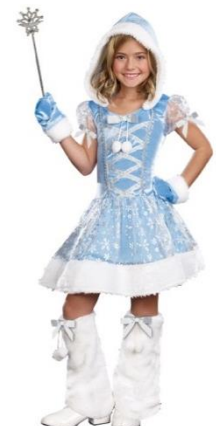
Style 9027 Snowflake Princess Size: S, M, L $14.95