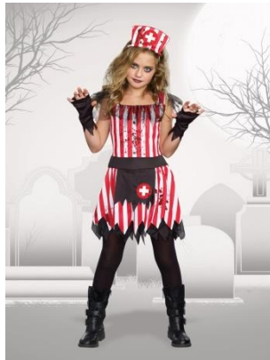
Style 9938 Candy Striper Size: S, M, L $14.95