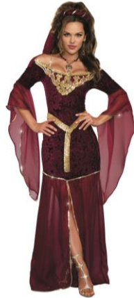
Style 9842 Medieval Enchantress Size: S, M, L, XL $25.95 Also available in Plus