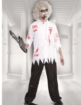
Style 9902 Dr. Hugh B. Dead Size: M, L, XL, XXL $24.95