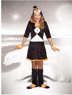
Style 9926 Pretty Lil Penguin Size: S, M, L, XL $13.95