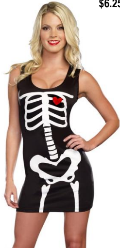
Style 9991 Skeleton starter dress Size: S, M, L, XL $9.95