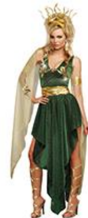
Style 9442 Medusa Size: S, M, L, XL $30.95