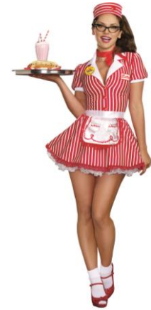
Style 9975 Diner Doll Size: S, M, L, XL $24.95 Also available in plus