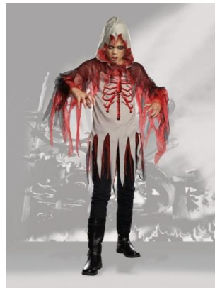
Style 9952 Ghouls of Summer Size: S, M, L $11.95