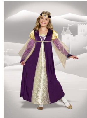
Style 9940 Royal Princess Size: XS, S, M, L $16.95