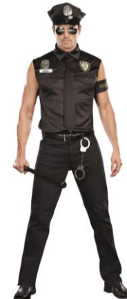
Style 8817 Dirty Cop Officer Ed Banger M, L, XL, XXL $21.95