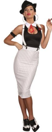
Style 9889 Dirty Work Size: S, M, L, XL $27.95