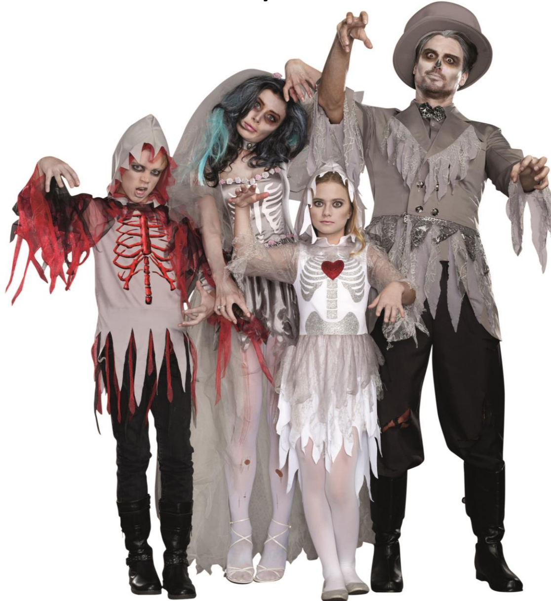
Style 9952 Ghouls of Summer Size: S, M, L $11.95