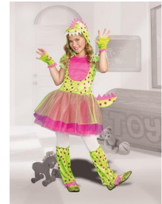
Style 9922 Dainty Dinosaur Size: XS, S, M, L $14.95