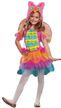
Style 9051 Precious Lil' Owl Size: XS, S, M $15.95