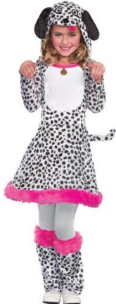
Style 9606 I'm Seeing Spots Size: XS, S, M, L $13.95