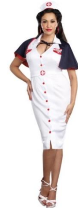
Style 9964X Night Nurse Size: 1X/2X, 3X/4X $29.95