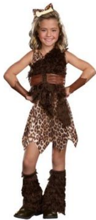
Style 9029 Cave Cutie Size: S, M, L $11.95