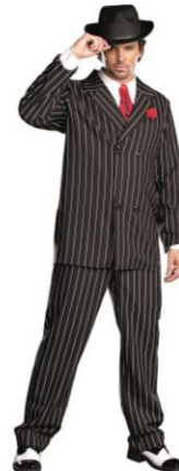
Style 8190 Gangsta M, L, XL, XXL $25.95