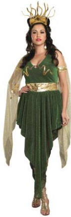
Style 9442X Medusa Size: 1X/2X, 3X/4X $32.95