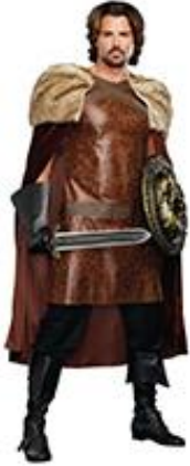
Style 9409 Dragon Warrior King M, L, XL, XXL $25.95