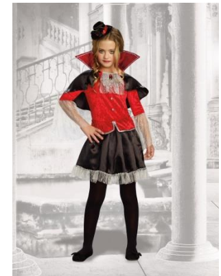
Style 9920 Midnight Miss Size: S, M, L $15.95