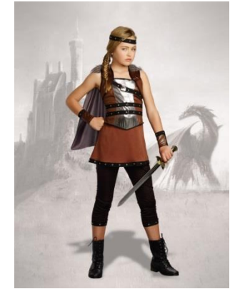
Style 9958 Battle Beauty Size: L, XL $17.95