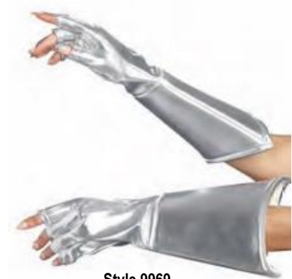
Style 9969 Silver Gauntlet Gloves Size: O/S $3.75