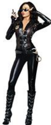
Style 9443 Special Ops Size: S, M, L, XL $28.95