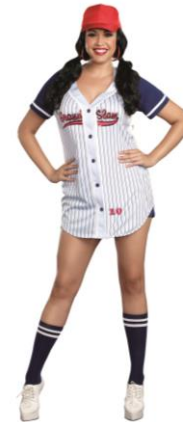
Style 6469X Grand Slam Size: 1X/2X, 3X/4X $27.95