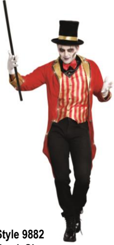
Style 9882 Freak Show Size: M, L, XL, XXL $23.95