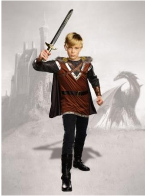
Style 9941 Warrior Knight Size: S, M, L $14.95