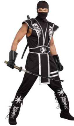
Style 9977 Blades of Death Size: M, L, XL, XXL $25.95