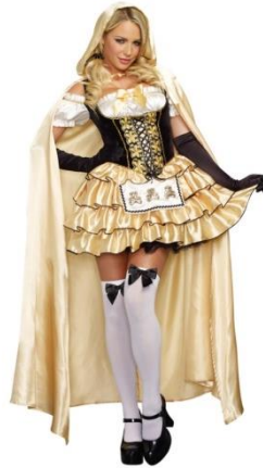
Style 9895 Goldilocks Size: S, M, L, XL $27.95 Also available in plus