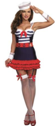
Style 9861 Sailor's Delight Size: S, M, L, XL $25.95