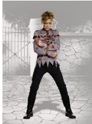
Style 9939 Gone Mental Size: S, M, L $10.95