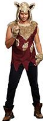
Style 9493 Big Bad Wolf M, L, XL, XXL $24.95