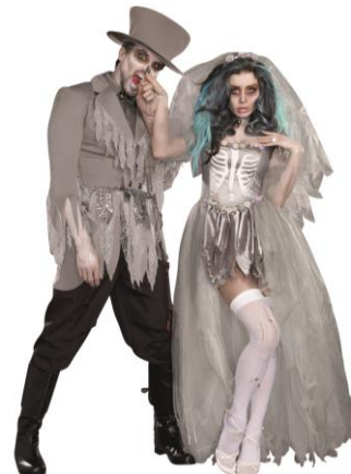
Style 9945 Bride of Doom $33.95 Style 9946 Groom of Doom $28.95