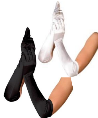
Style 5218 Luna Glove Size: One size $3.95