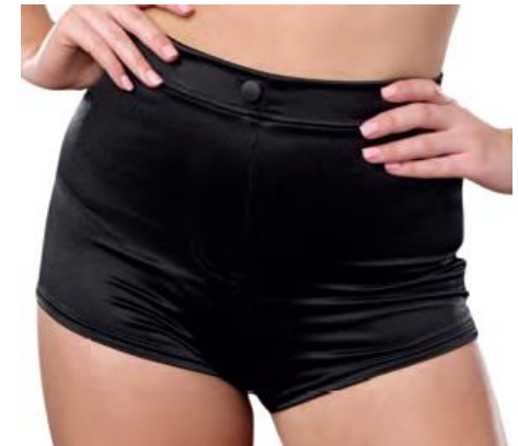
Style 9974 Hi-Waist Short Black Size: S/M, M/L $7.25