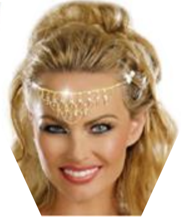
Style 9520 Glittering Rhinestone Headpiece Size: O/S $4.50