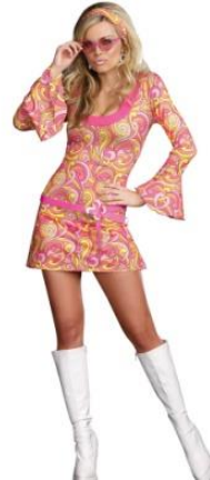
Style 8158 Go Go Gorgeous Size: S, M, L, XL $18.95 Also Available in Plus