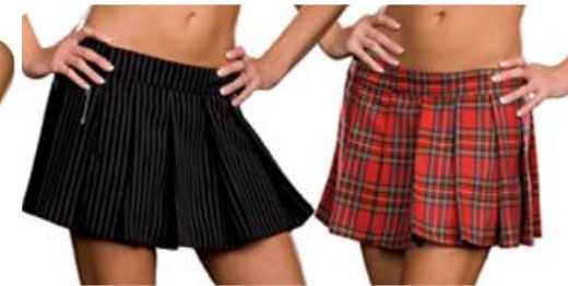
Style 6586 Schoolgirl/Gangster skirt Size: S, M, L, XL $12.95