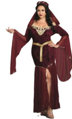
Style 9842X Medieval Enchantress Size: 1X/2X, 3X/4X $27.95