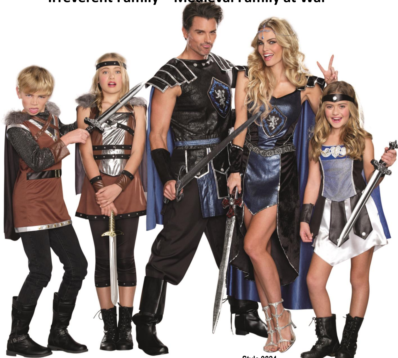
Style 9941 Warrior Knight Size: S, M, L $14.95