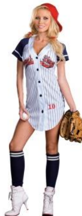
Style 6469 Grand Slam Size: S, M, L, XL $25.95