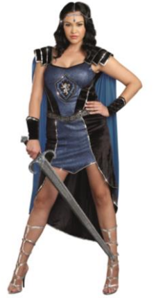
Style 9824X King Slayer Size: 1X/2X, 3X/4X $30.95