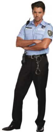
Style 9947 Prison Guard Hugh B. Guilty Size: M, L, XL, XXL $22.95