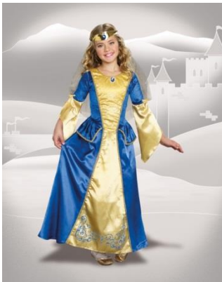
Style 9919 Renaissance Princess Size: XS, S, M, L $13.95