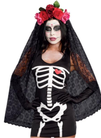
Style 10003 Day of the Dead headpiece Size: O/S $9.25