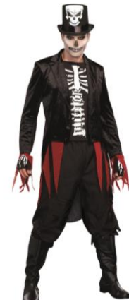
Style 9904 Mr. Bones Size: M, L, XL, XXL $28.95