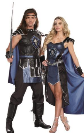
Style 9824 King Slayer (F) $28.95 Style 9825 King Slayer (M) $24.95