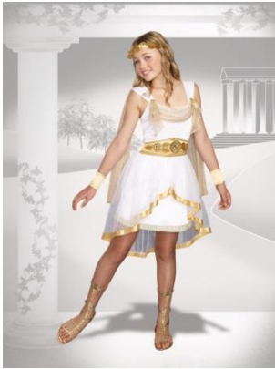
Style 9930 Miss Olympian Size: L, XL $14.95