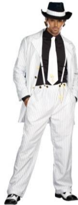
Style 8105 Zoot Suit Riot M, L, XL, XXL $24.95