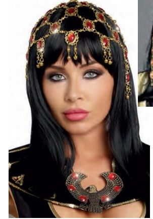
Style 9972 Dazzling Rubies headpiece Size: O/S $7.50