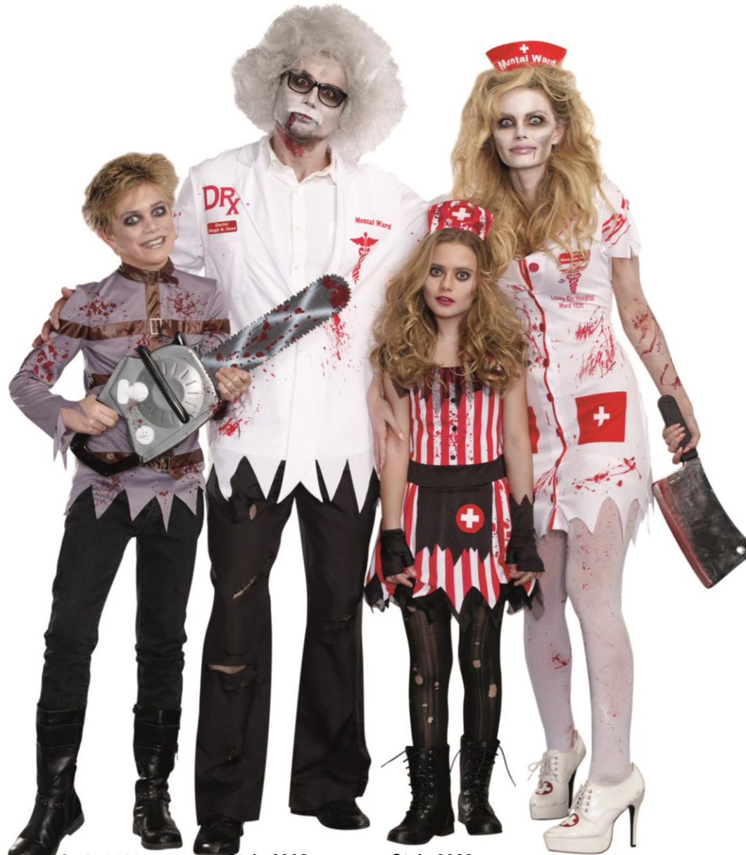
Style 9939 Gone Mental Size: S, M, L $10.95