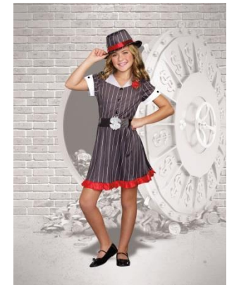
Style 9921 Ally Capone Size: S, M, L $13.95