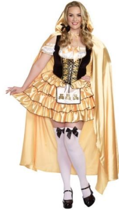
Style 9895X Goldilocks Size: 1X/2X, 3X/4X $29.95