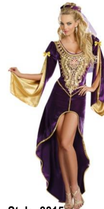
Style 8815 Queen of Thrones Size: S, M, L, XL $29.95 Also Available in Plus