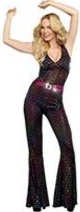
Style 9469 Disco Doll Size: S, M, L, XL $15.95