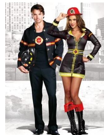
Style 9887 Too Hot To Handle $25.95 Style 6550 Smokin' Hot Fireman $22.95