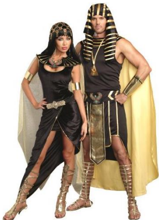
Style 9833 Cleo $32.95 Style 9893 King of Egypt $27.95