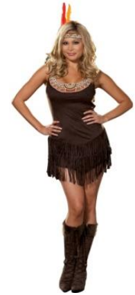
Style 5877X Pocahontia Size: 1X/2X, 3X/4X $27.95