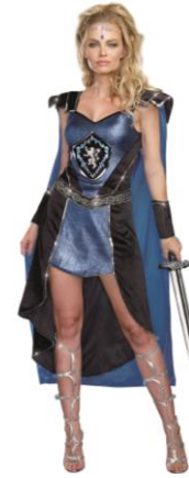
Style 9824 King Slayer Size: S, M, L, XL $28.95 Also available in Plus