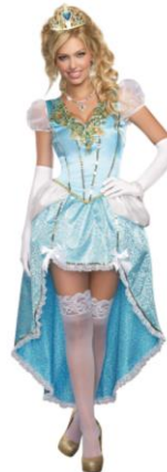
Style 9473 Having A Ball Size: S, M, L, XL $26.95