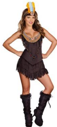
Style 8196 Reservation Royalty Size: S, M, L, XL $28.95