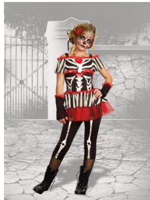
Style 9942 Senorita Bone-ita Size: S, M, L $14.95