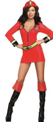
Style 9445 Where's The Fire? Size: S, M, L, XL $25.95