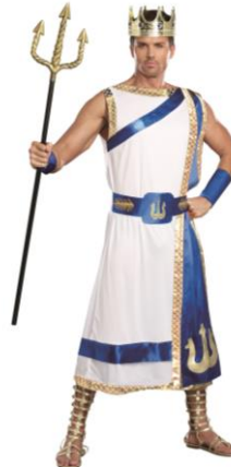
Style 9854 Posiedon Size: M, L, XL, XXL $21.95