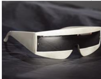
Style 9970 Galaxy Glasses Size: O/S $4.50