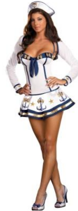
Style 5985 Makin' Waves Size: S, M, L, XL $26.95 Also Available in Plus