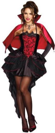
Style 9878 To Die Over Size: S, M, L, XL $28.95