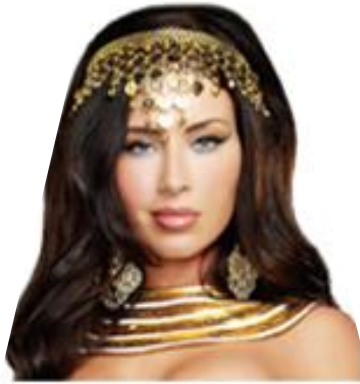
Style 9523 Shimmering Gold Coin Crown Size: O/S $3.50