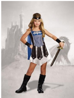
Style 9957 Gladiator Girl Size: S, M, L $14.95