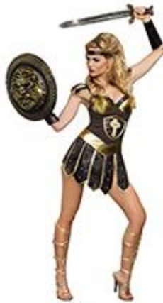
Style 9404 Queen Of Swords Warrior Size: S, M, L, XL $27.95