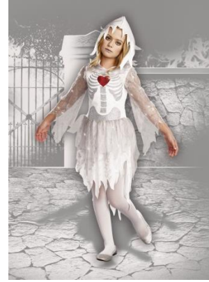
Style 9951 Sweet N Spooky Size: S, M, L $13.95