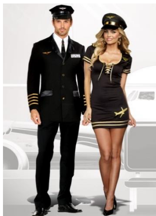
Style 9918 Service With A Smile $24.95 Style 5236 Mile High Pilot Hugh Jorgan $24.95