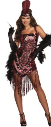
Style 9834 Gatsby Girl Size: S, M, L, XL $26.95