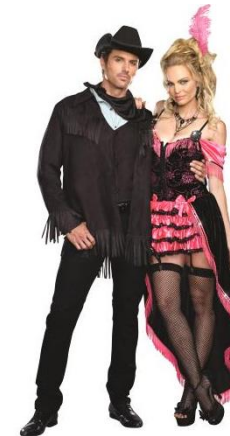
Style 9831 Whiskey Girl $28.95 Style 9832 Buck Wild $24.95