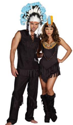
Style 8196 Reservation Royalty $28.95 Style 8197 Chief Wansum Tail $22.95