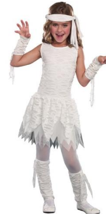
Style 9581 Wrap It Up Size: XS, S, M, L $14.95