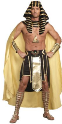
Style 9893 King Of Egypt Size: M, L, XL, XXL $27.95