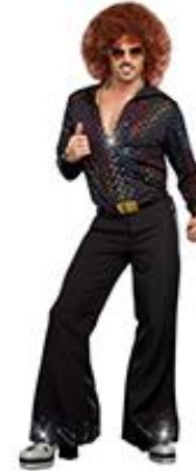
Style 9468 Disco Dude M, L, XL, XXL $15.95