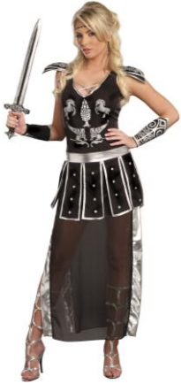
Style 9826 Glorious Gladiator Size: S, M, L, XL $28.95