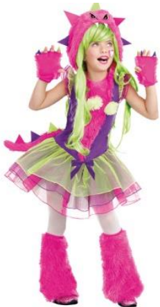
Style 9024 Fur-ocious Lil' Creature Size: S, M, L $15.95