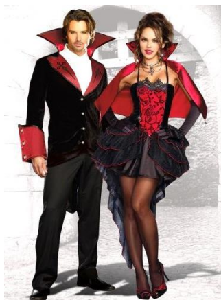
Style 9878 To Die For $28.95 Style 8177 Just One Bite $25.95