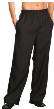
Style 6379 Men's Basic Pant Size: M, L, XL, XXL $8.50