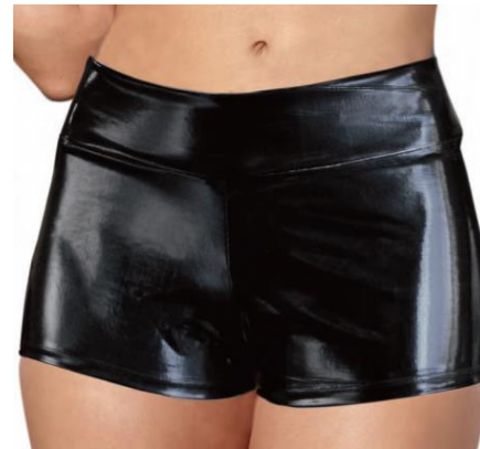
Style 9994 Liquid Roxy short Black Size: S/M, M/L $5.75