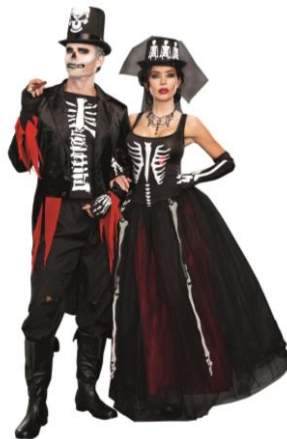
Style 9903 Ms. Bones $28.95 Style 9904 Mr. Bones $28.95