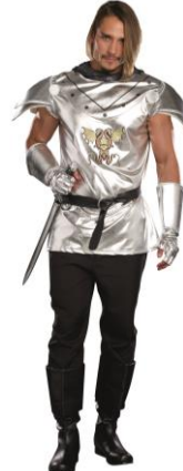
Style 9968 Knight Time Size: M, L, XL, XXL $29.95