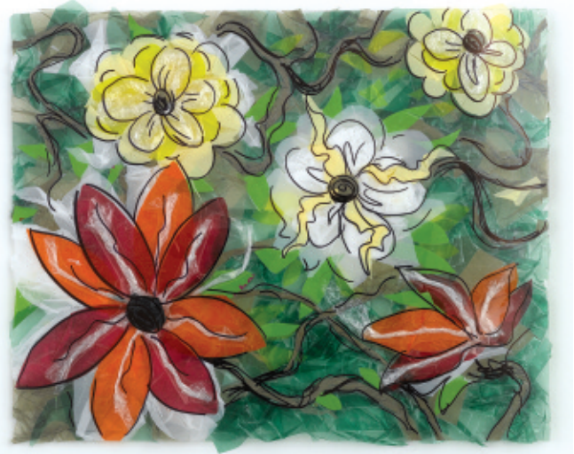
Front side view

JD