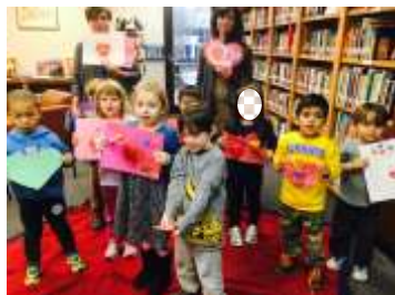
Preschool students made valentines for the Ronald McDonald House

Registration is open for next fall for all classes, except the one year old room, which is full.