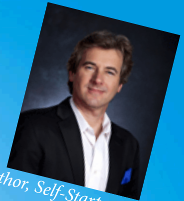
Author, Self-Starter and Teacher

“How To Supervise People and Lead a Team.”