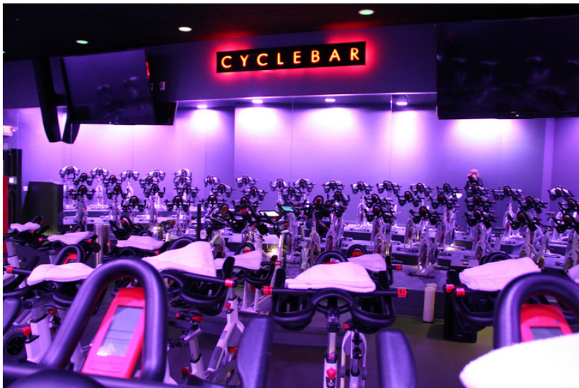
CycleBar studios include a live D.J. booth and each location features 50 bicycles with concert-style lighting.

Town Sports International, which operates a Northeast chain including New York Sports Clubs, in 2014 launched stand-alone, class-centered BFX Studios. Cycling and high-intensity interval training classes at BFX run $32 each. It costs $20 to $40 a month to belong to most of the chain's traditional clubs. The chain recently lowered prices in response to low-cost clubs like Planet Fitness.