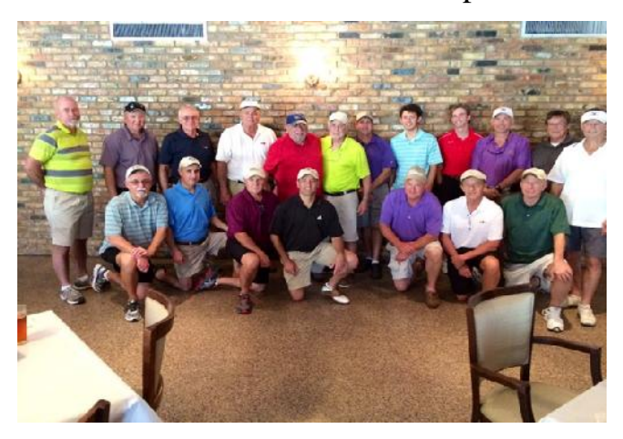
Congrats to the MGA March 21st winners!!!