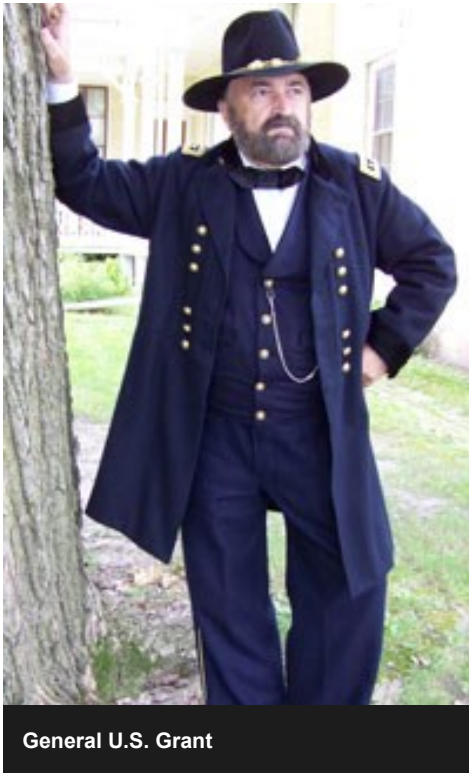
General U.S. Grant