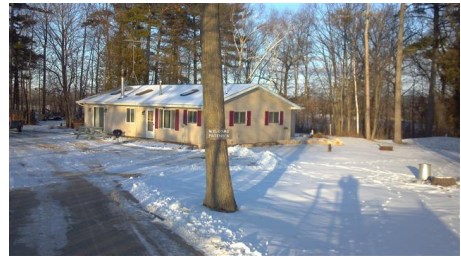
Little Sturgeon Vacation Rentals Located in Little Sturgeon, on County CC