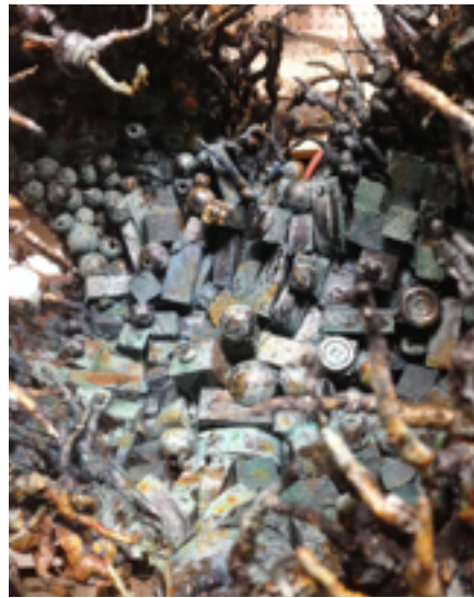
"Celestial Voices," View of Center