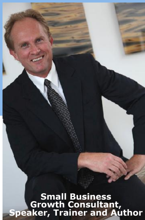
Small Business Growth Consultant, Speaker, Trainer and Author