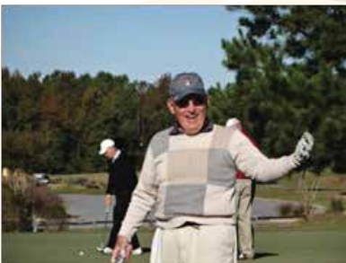
HOLE-IN-ONE - PRACTICE GREEN