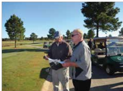
WHERE IS #1 HOLE?