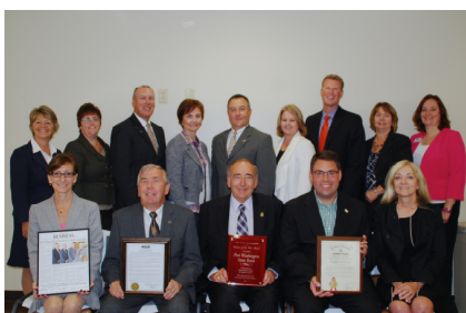
Port Washington State Bank

OED advances the business prosperity of Ozaukee County collaborating with community, regional and business partners ensuring a growing and diversified economy.