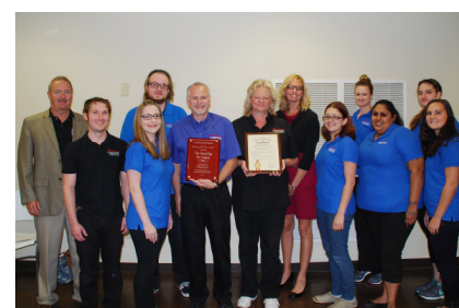
The Feed Bag Pet Supply