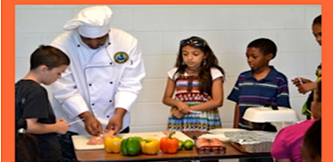
Healthy Food Demonstration