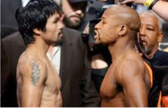
Manny Pacquiao and Floyd Mayweather are two of the world's best boxers.

May 2nd is a big day in the world of sports. It is going to be the date of four major sports events. The fight that was just announced will make it a huge day for boxing, Manny Pacquiao will fight Floyd Mayweather in this featherweight bout. Many people consider Manny Pacquiao and Floyd Mayweather to be the best boxers in the business today. Mayweather is 47-0 and Manny is 57-5-2. The match is going to make 74 million dollars from ticket sales. The cheapest tickets are 2,500 dollars!