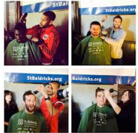
DC United players go bald to raise money and awareness for fight against childhood cancers.