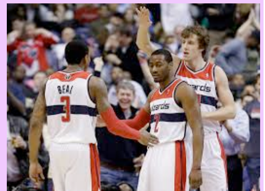
Bradley Beal high fiving his teammates.

Still, they have gotten back into their flow and have started playing like the Wizards we know and love. That's pretty good, but in their last few games, they have unfortunately been playing without much energy. To go far in the play-offs the Wizards must pick up the pace.