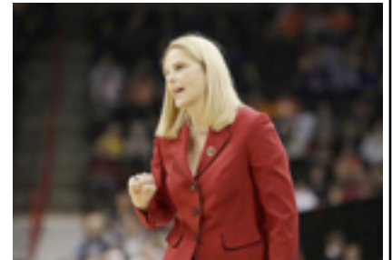
Coach Brenda Frese is one of the reasons that Maryland is so good.