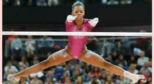
Gabby Douglas won the prestigious all-around competition.