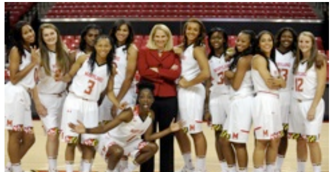
Awesome! That was Maryland this year!