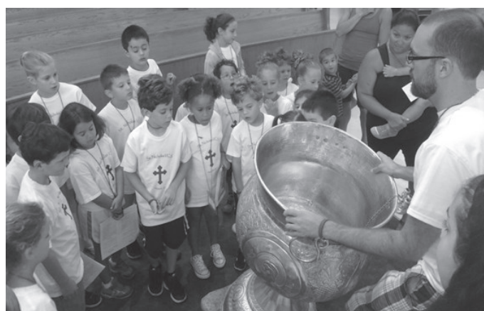
One of the most popular activities was show-and-tell in the church. On Wednesday, we learned about our own baptism by looking at the baptismal font.