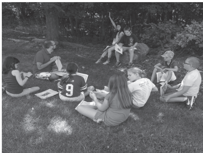
Each day included a lesson, which gave the youth the opportunity to ask questions and engage their faith.