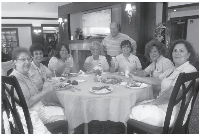
Thank You to all our Golf Ministry Team members (including those not in the picture)