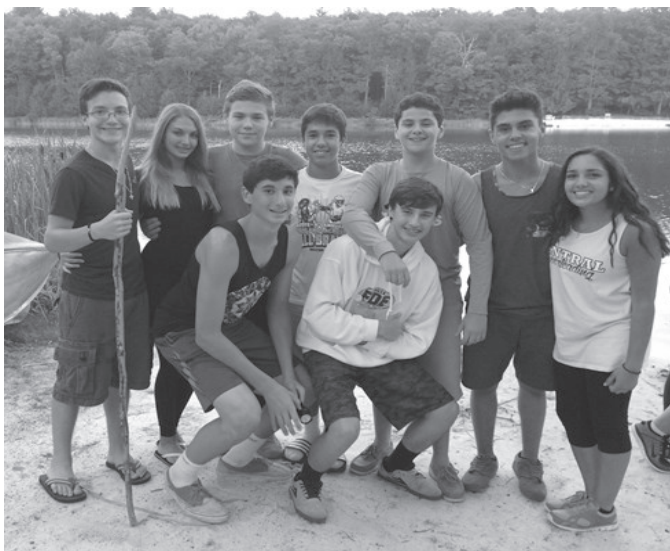
CGS: GOYA WEEK 2