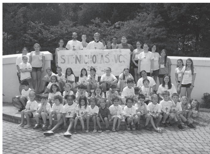
Here are our 29 campers along with our excellent volunteers for VCS 2015.