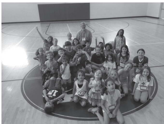
VCS included games and time each day to have fun as a group.