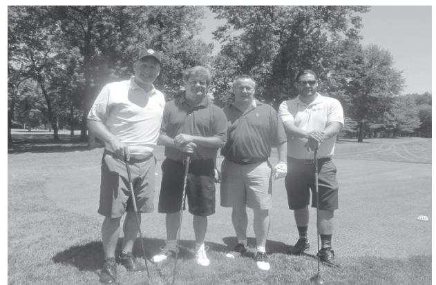
To all the Golfers Thank You for your support!