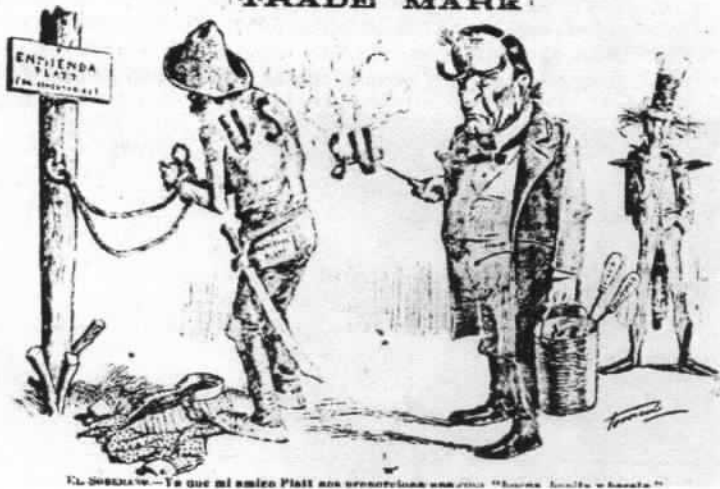
El Sincronista—Ya que el amigo Platt nos presentaba una cosa "buena" había que hacerla.

forever obey." Immediately after the signing of the treaty, the US-owned "Island of Cuba Real Estate Company" opened for business to sell Cuban land to Americans.