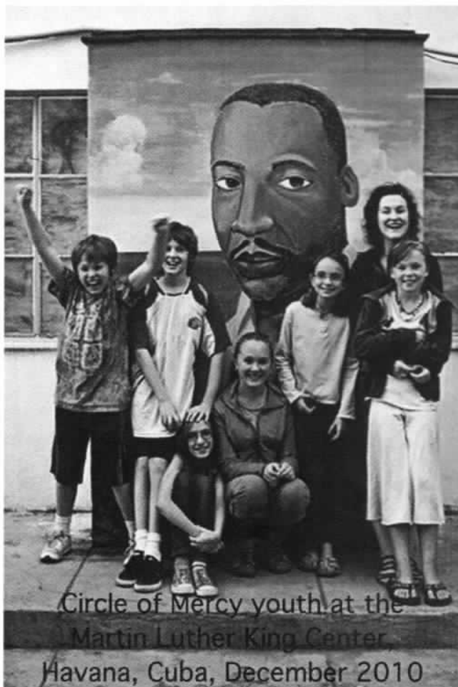
Circle of Mercy youth at the Martin Luther King Center, Havana, Cuba, December 2010

13. Christopher Columbus' first landfall in the Americas was on 28 October 1492, in Barlay, a bay on the northeast coast in what is now the Holguin Province. He thought he was in India—thus Indians as the term for indigenous peoples.