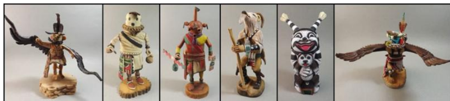
New katsina dolls