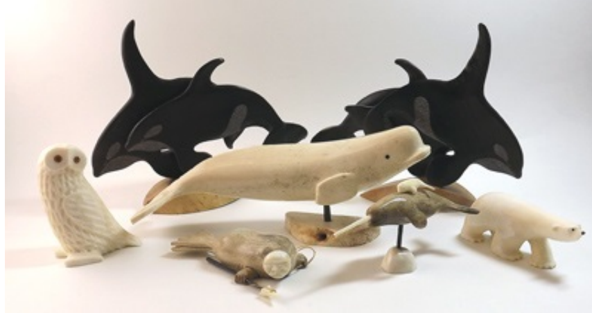
New Alaskan carvings

This newsletter is available as a downloadable PDF .