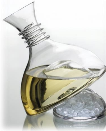
Frio Decanter with ice holder for white wines £45.00