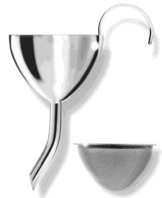
Stainless Steel Decanting Funnel with Strainer £14.99