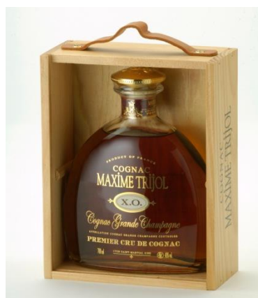
Maxim Trijol XO Grande Champagne Cognac £99.00