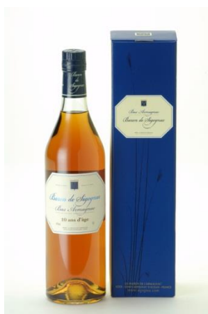
Baron de Sigognac 10 Year Old Armagnac £42.00