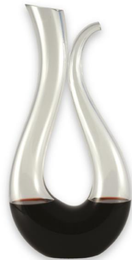
Swan Decanter £149.00