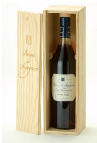
Baron de Sigognac 20 Year Old Armagnac £65.00