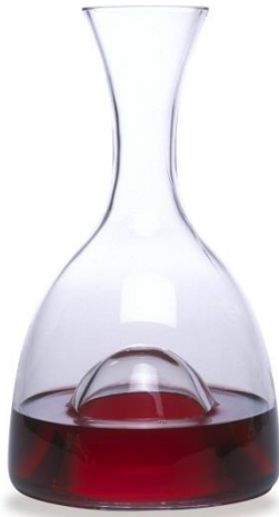
Visual Decanter £49.00

Please note that glassware may only be ordered for local delivery.