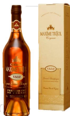
Maxim Trijol VSOP Grande Champagne Cognac £49.00

BUY ANY 2 BOTTLES FROM THIS SELECTION AND SAVE £5.00