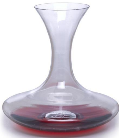
Master Decanter £49.00