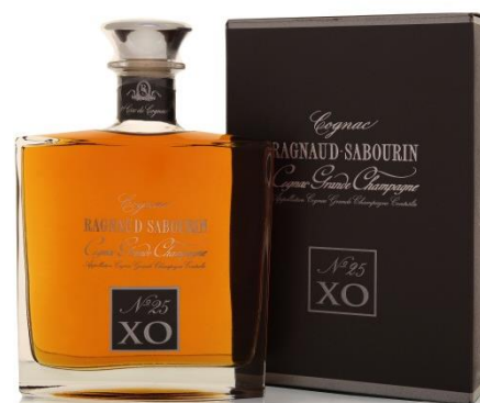
Ragnaud-Sabourin No.25 XO Grande Champagne Cognac £125.00