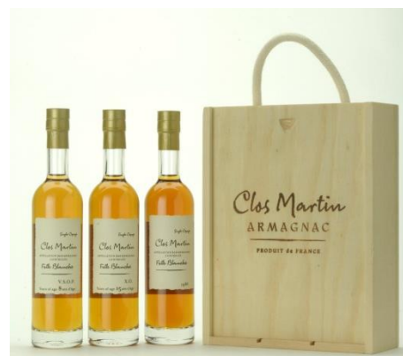
Clos Martin Armagnac Gift Set 3 x 20cl VSOP, XO & 1986 £59.00