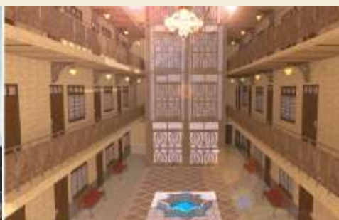
Proposed Internal View