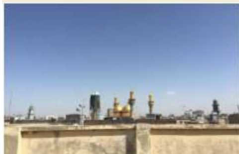
View from Terrace of Musafirkhana

Current Status: Awaiting Vacant Possession Soon