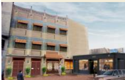
Proposed External View

Estimated date of completion: First Quarter of 2016 Insha Allah