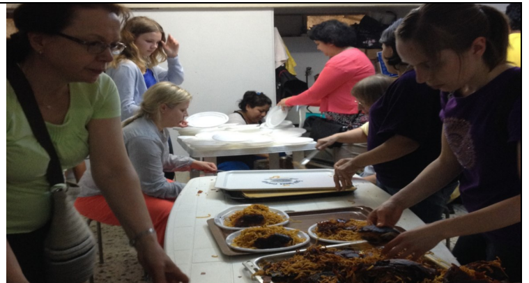
Feeding Refugees - Matthew 25:40

He told me he looks forward to my next visit when we are in Athens in October. He smiled and then said, "I can't wait to hug you brother...if we are still alive." Our hope in Jesus is our only hope. This is the time for real faith and courage in us all.