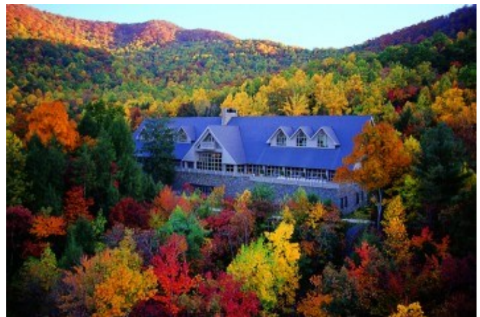
The Cove Retreat Center, Asheville, North Carolina

http://billygraham.org/landingpages/nler/images/Law_Enforcement_Retreat_Flier.pdf