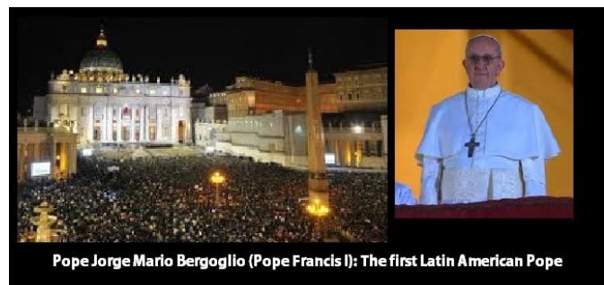
Pope Jorge Mario Bergoglio (Pope Francis I): The first Latin American Pope