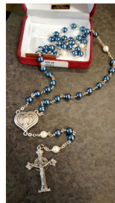
Lourdes Rosary with meditation booklet