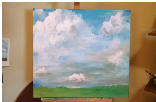
Early stage of a scenic picture that my sister-in-law is painting for the raffle. Only she knows the end result.