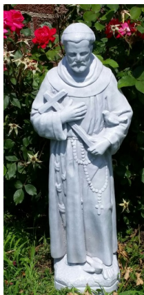
St. Francis Garden Status