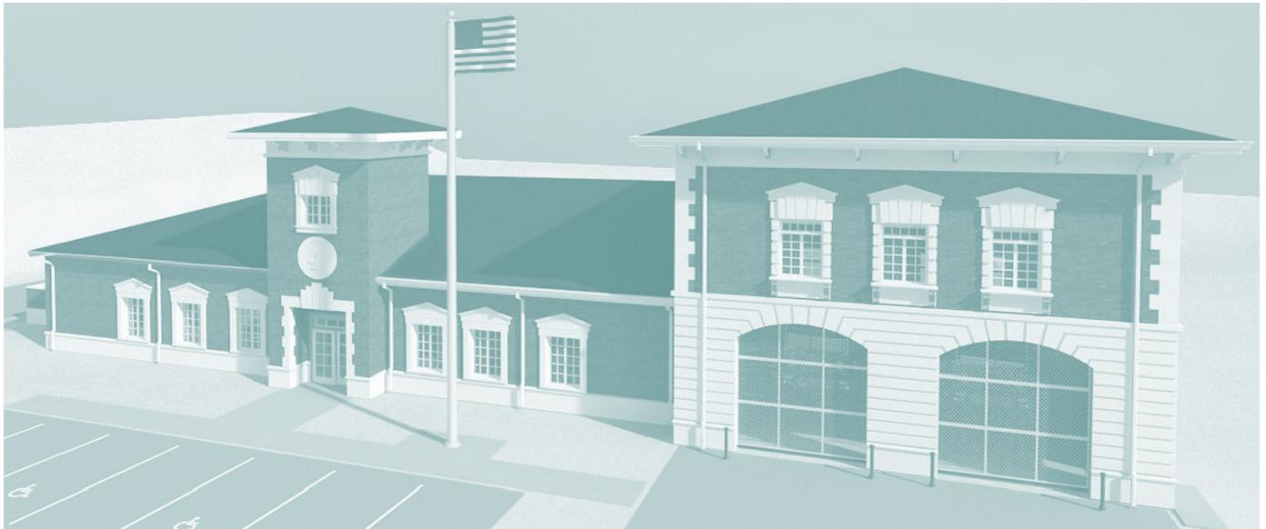
Fire Station # 4