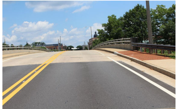
LaGrange Street Bridge

This project consists of street rehabilitation, sidewalk repairs and lighting enhancements at the bridge. All paving is complete and some concrete work will be done in-house. The guardrails have been painted by City staff. Some of the accent lighting has been installed. R.D. Cole lights are being placed on each end and sides of the bridge. The funding source is SPLOST 2013. Contact: mklahr@cityofnewnan.org