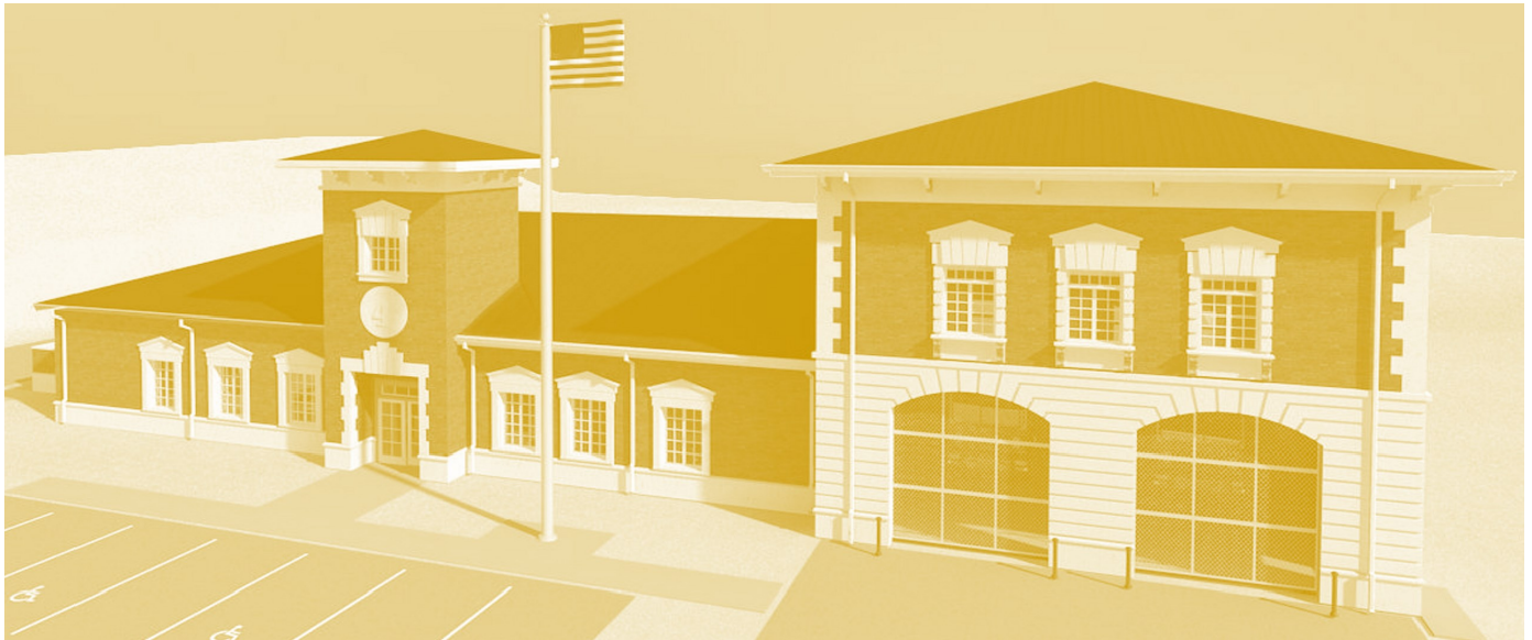
Fire Station # 4