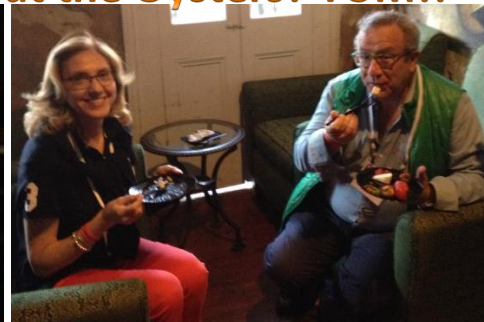
Does Avellino know how to throw a party? Ask any of our guests.